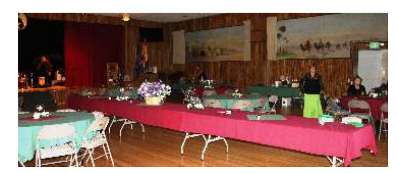
Setting up for the 2019 Wine Tasting

The Provost Guard is looking forward to the remainder of this year!