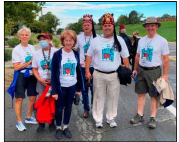
Walkers Getting for the Salt Lake Walk for Love

Saturday morning the weather cooperated and we had a fun Walk. Two years ago, over a thousand people walked. This year only 40-50 walked, but we still had 770 registered and made over $100K. Thanks to all of you who donate money, time and