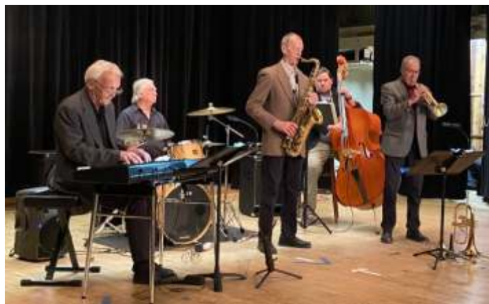
Special Thanks to the Grapeful Dead