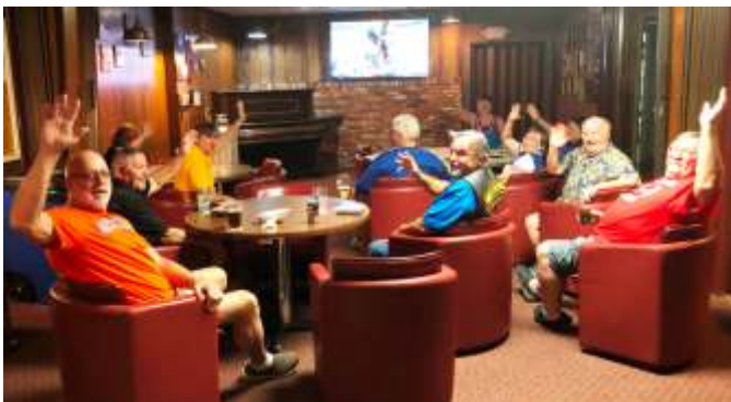
Tailgating El Korah Style on Sept 3rd Boise State - Oregon State football game

The Portland Hospital held a Virtual Hospital Day on September 23. While the number of people attending was down this year, the quality of the presentations would make any Shriner, employee, and supporter of the Portland Hospital proud. A special thank you to all of the staff who presented during this event!