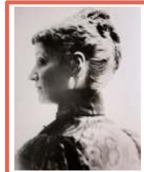
Mary Hallock Foote

Don't miss this galvanizing exploration of WALLACE STEGNER's controversial use of the life and writing of MARY HALLOCK FOOTE in his Pulitzer Prize-winning novel, Angle of Repose .