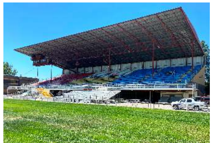
Expo Idaho Grandstands at the former Les Bois Park Horse Race Track

Look for more to come as we plan for the 2024 Circus.