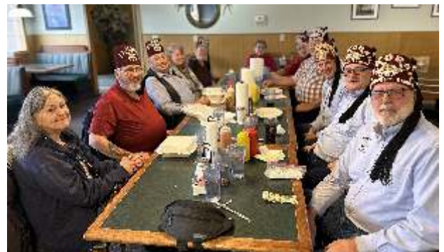
Gathering for Lunch in Arco, ID

If you are part of a group of Shriners that occasionally gets together and would like your the Divan to join you, contact any of the Divan member and we will try our best to fit a