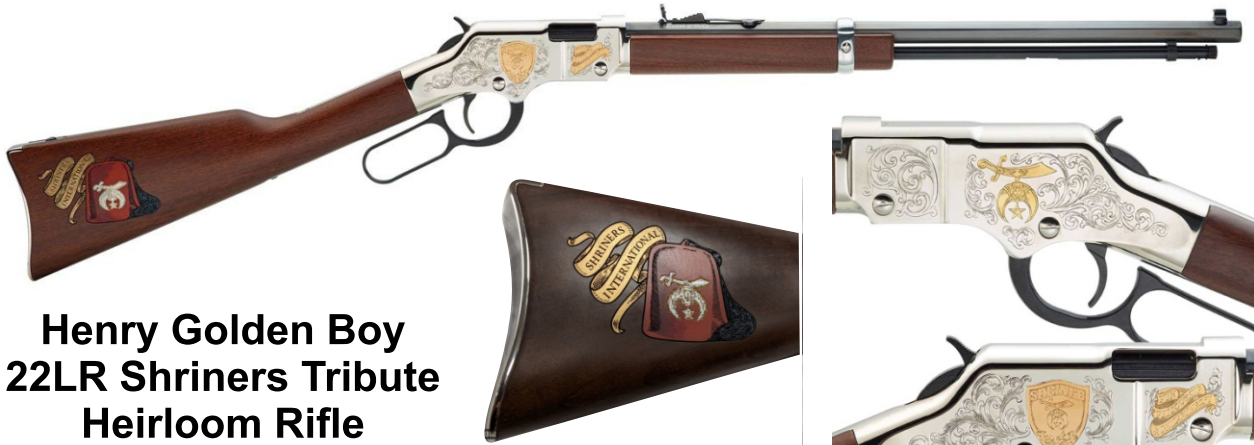
Henry Golden Boy 22LR Shriners Tribute Heirloom Rifle