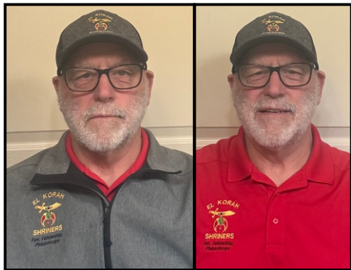
"Timeless" Jacket, Shirt and Cap

I want to encourage the Nobility to participate in the Shrine Red Shirt Friday on the first Friday of every month (or every Friday, if you'd like). Wear a Red Shrine Shirt for the day if you have one, or any color Shrine Shirt if you don't, and represent the El Korah Shriners to all of those that you encounter during the day. Be prepared to answer questions about our wonderful organization.