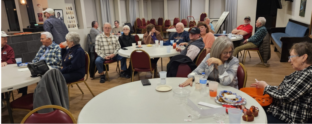
January 27th - The crowd pauses action during a commercial break at the Boise Masonic Center