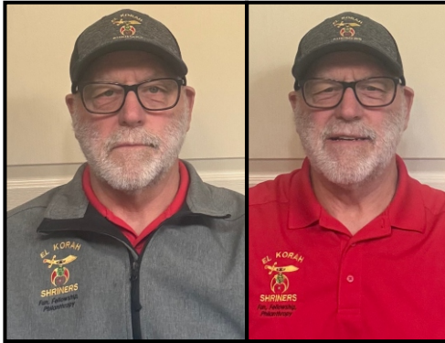
"Timeless" Jacket, Shirt and Cap

from the community were in attendance at this fun "mini golf" event and had a chance to see the good work done by their local Shriners and given an opportunity to consider joining our organization.