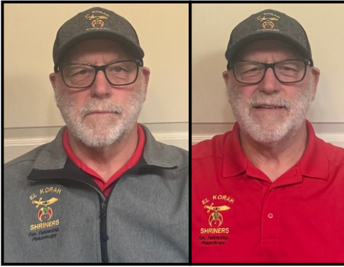
"Timeless" Jacket, Shirt and Cap

brothers. I will continue these visits and hope to get other Shriners to join me in these visits and show our support for these brothers. If you haven't been to your lodge in a while, this is an excellent opportunity to reconnect. Remember, there could be no Shriners without the Masons.